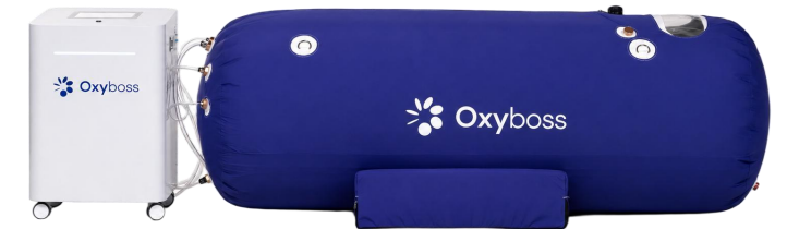
Soft Lying Type Hyperbaric Chamber