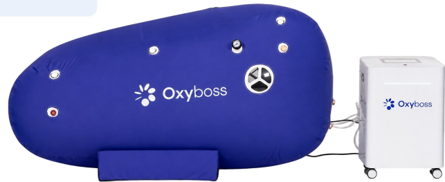
Soft Sitting Type Triangle Hyperbaric Chamber