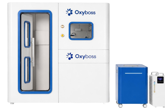
Hard Sitting Room Type Hyperbaric Chamber