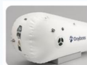
TPU cabin material