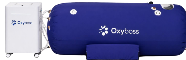
Soft Lying Type Hyperbaric Chamber