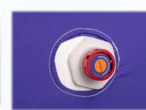
Automatic Pressure Relief Valve