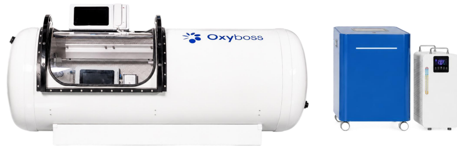
Hard Lying Type Hyperbaric Chamber