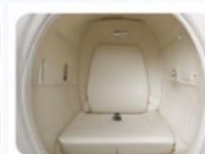
Stable Triangle Structure